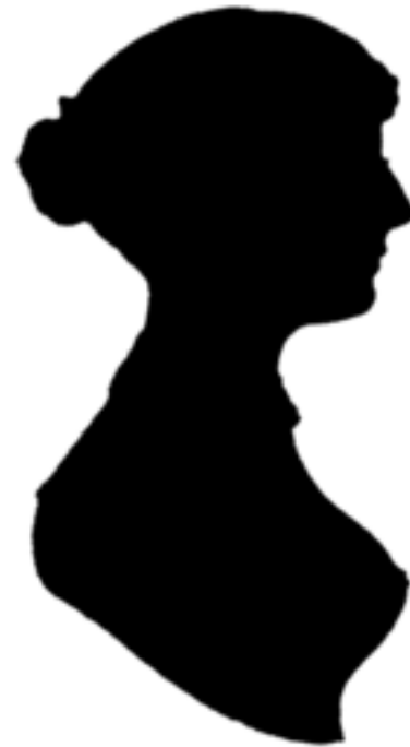
a silhouette of Jane Austen