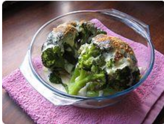
béchamel and broccoli