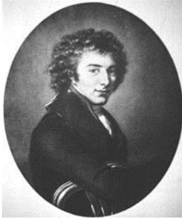
Alexander Grigorievich Stroganoff