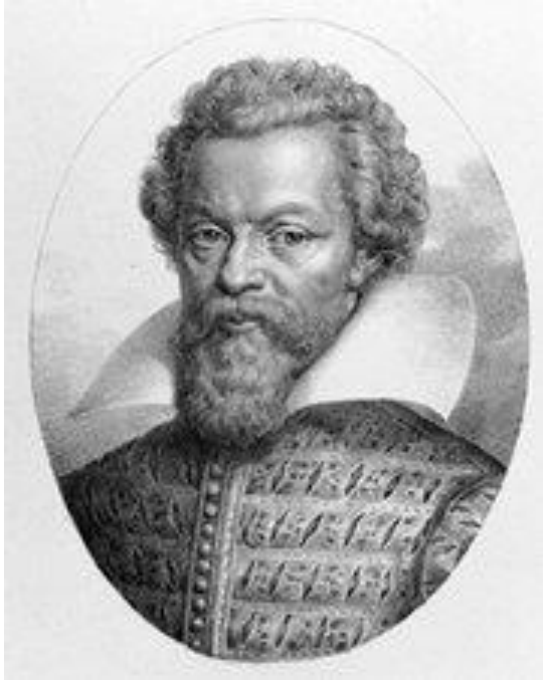
Louis de Bechamel a French financier